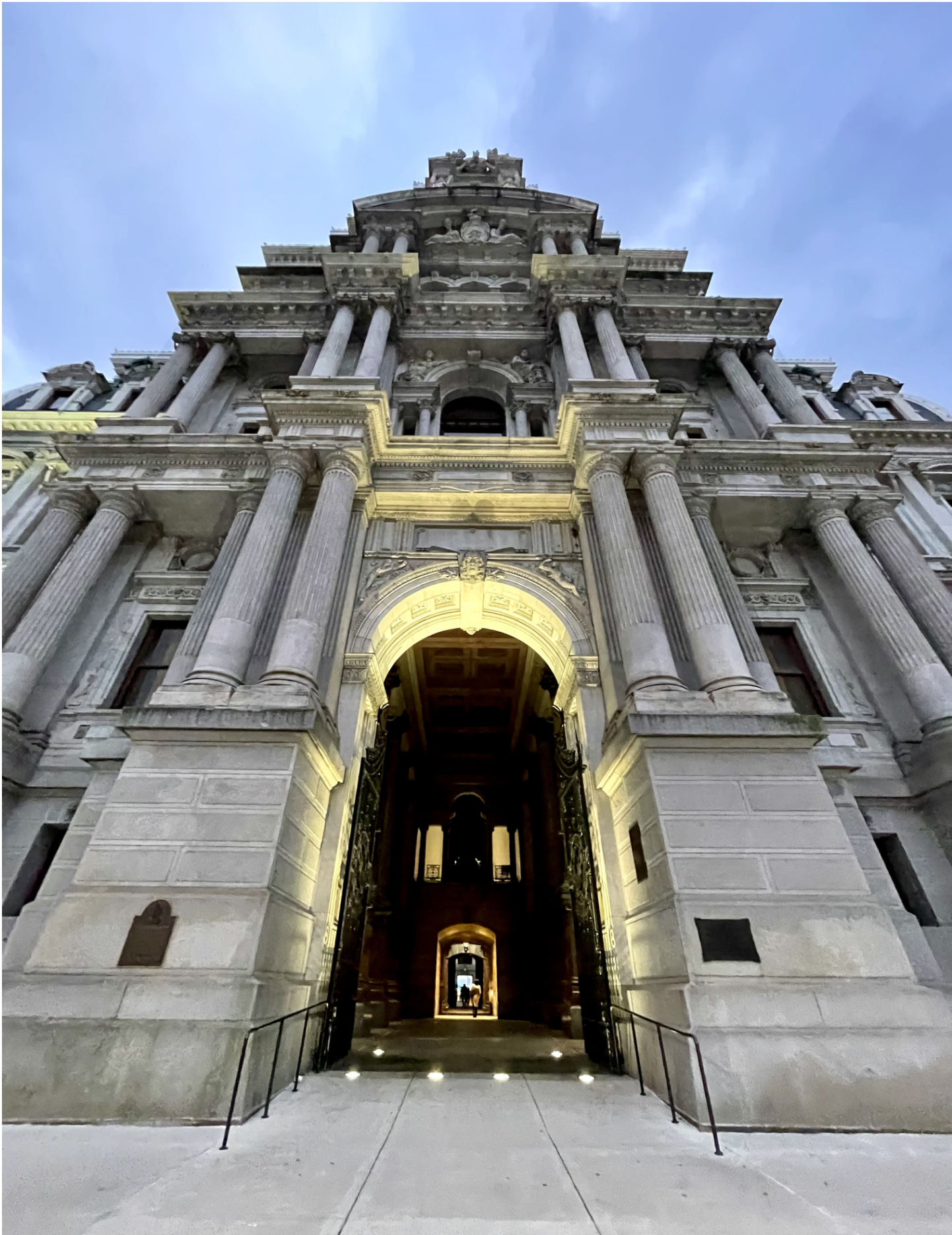
IMAGE OF THE PHILADELPHIA, PA SURROUNDING AREA